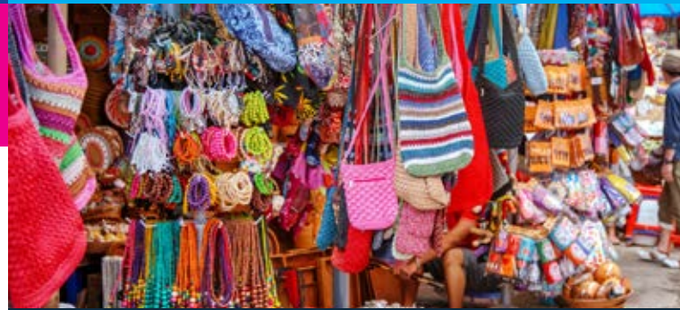
Balinese Art Markets Ubud, Denpasar, Kuta