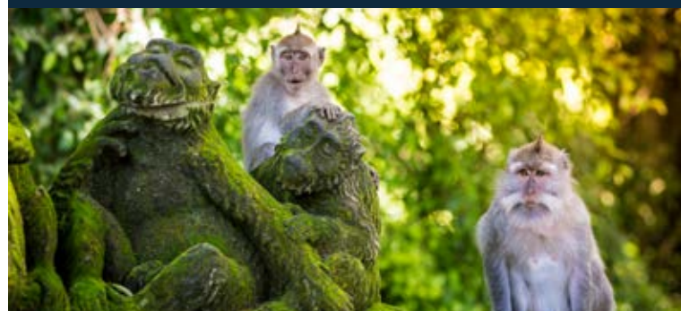
Monkey Forests Sangheh & Ubud