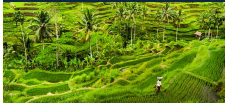
Tegallalang Rice Terraces Ubud