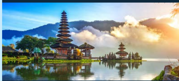
Balinese Temples Tabanan, Karangasem, Badung, Gianyar