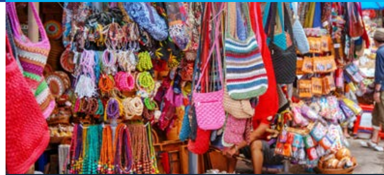
Balinese Art Markets Ubud, Denpasar, Kuta