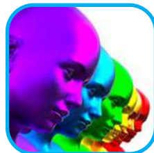
HR Essentials For Leaders