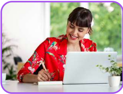
Pre + Post Program Individual Coaching