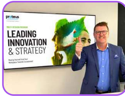
3 Virtual Programs (4 x sessions each)