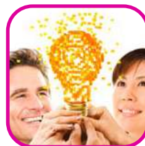
Creating A Culture Of Selling