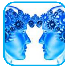
Leading Innovation & Strategy