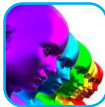
HR Essentials For Leaders