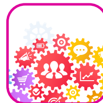
The Service Factor