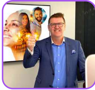
3 Virtual Programs (4 x sessions each)