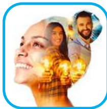
Leading People & Culture