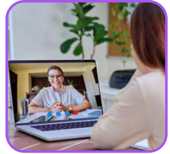
Personal Program Coaching (3 x individual sessions)