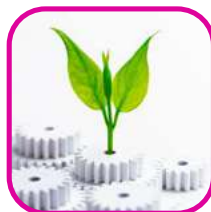
Moving from Busyness To Effectiveness

Each participant can also choose to participate in one of the following Online Learning programs: