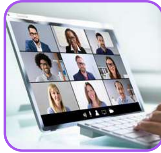
3 Program Review Sessions Following Programs