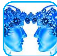
Leading Innovation & Strategy