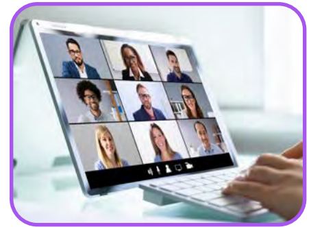
3 Group Coaching Sessions Following Programs