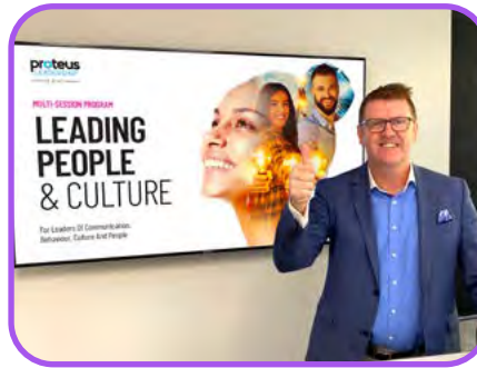
3 Virtual Programs (4 x sessions each)