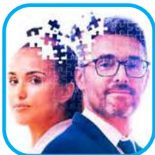
The Leader As Coach