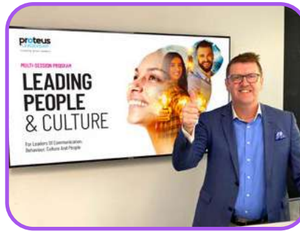
3 Virtual Programs (4 x sessions each)