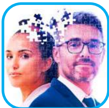
The Leader As Coach