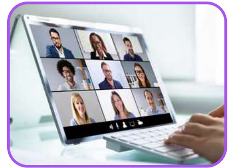
3 Program Review Sessions Following Programs