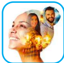
Leading People & Culture