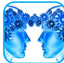
Leading Innovation & Strategy