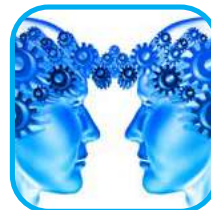
Leading Innovation & Strategy