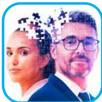
The Leader As Coach